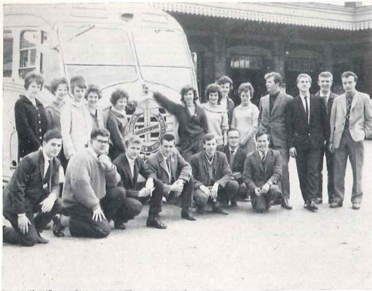
(1) The Association Holiday Party before leaving for Switzerland

The Association wish to thank the following journals and photographers who have the use of their photographs :—