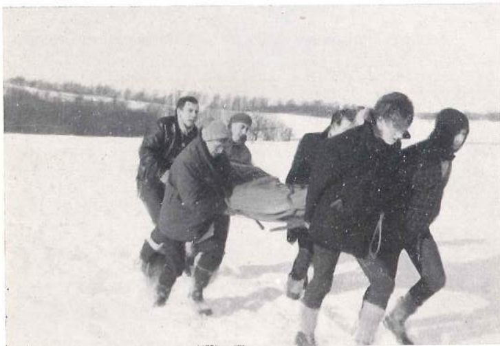
3. Adventure Training Weekend on the Cotswolds Members of Falcon House Youth Club transport a casualty