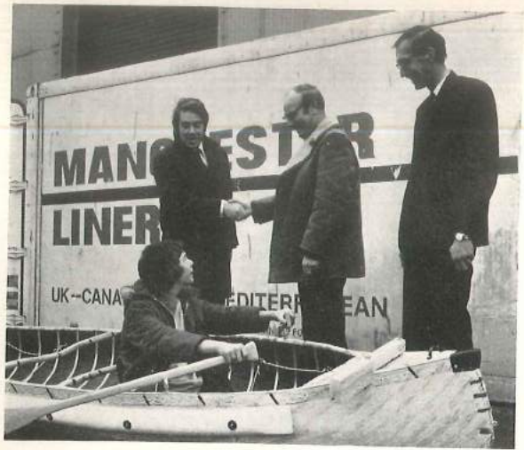
Canoes arrive— A gift from Canada