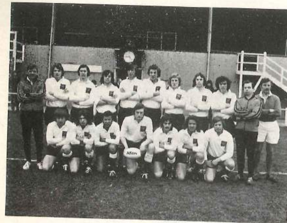
Englands Rugby Team with a record number of Gloucestershire boys