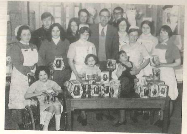
Cossacks Easter Gift to the Childrens Hospital