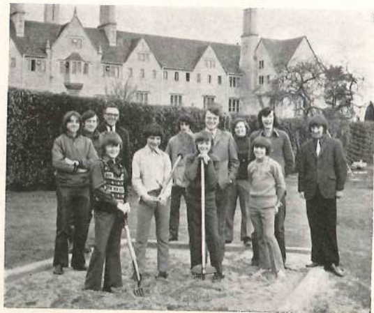
National Boys Club and Nailsworth member build an Adventure Playground for Gyde home