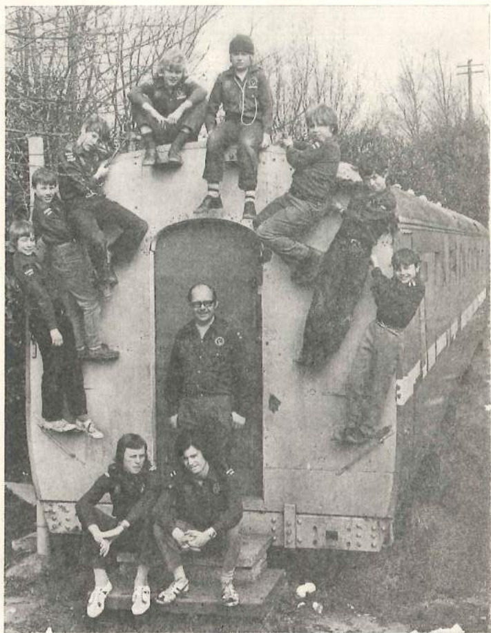
Kerne Bridge is taken over by young adventurers from Windsor